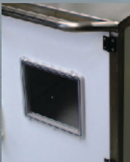
Slot model TAV L 24