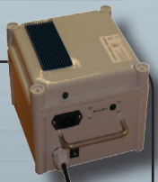
Battery lithium iron