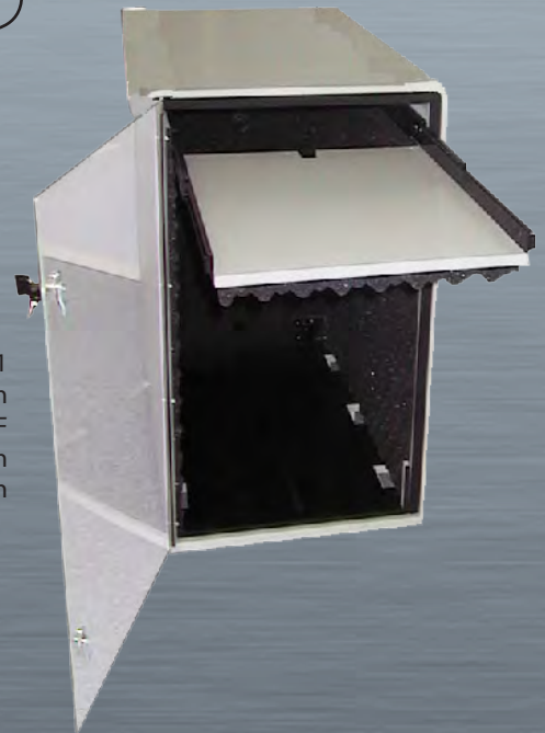
ISS 1 with KEYBOARD SHELF option and LOCK option