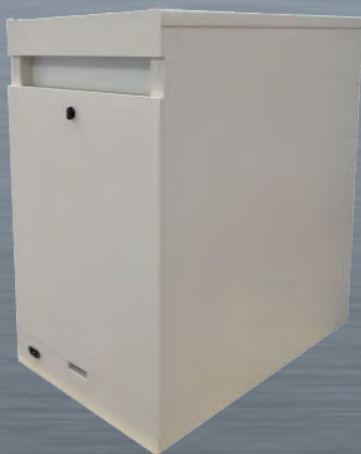
ISS 1: rear view