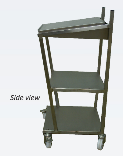
Stainless steel and leas model