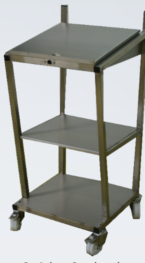
Stainless Steel and wheels model + compartment

Available in STEEL or tailor-made dimensions