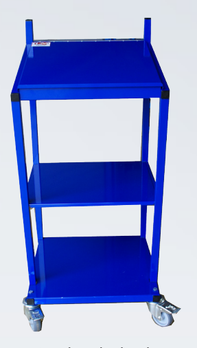
Steel and wheels model + compartment

Available in STAINLESS STEEL or tailor-made dimensions