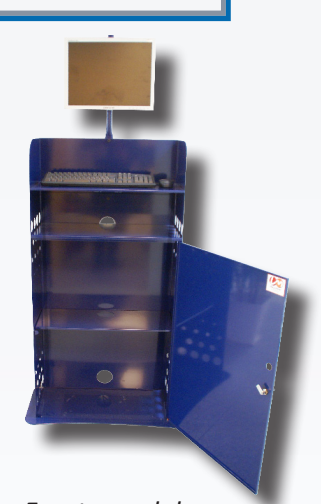
Front panel door open

Overall external W 600 x D 460 x H 1300 mm